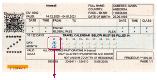
Travel day in the Travel Calendar

Once a travel day has been written in the Travel Calendar, it cannot be changed. Doing so can be considered attempted fraud. For this reason, you must use blue or black non-erasable ink to fill in the dates, and not pencil. If you do make a mistake, you will have to mark the correct date in a new box, which means you lose one travel day.